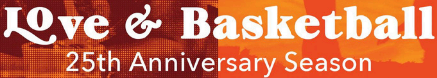
Table for Two

An Obsidian and Soulpepper Theatre Co-Production